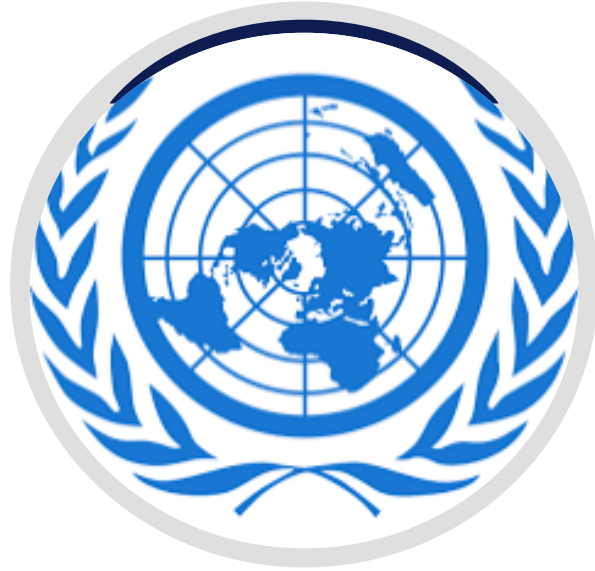
UNITED NATIONS OF NAIROBI (UNON)